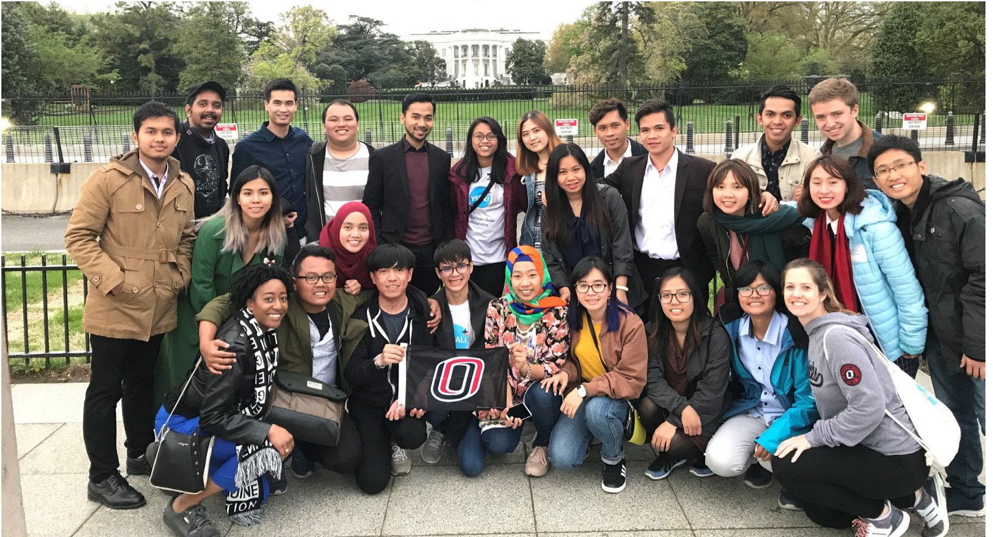
The Spring 2018 Academic Fellows from the Young Southeast Asian Leaders Initiative at UNO visit the White House.