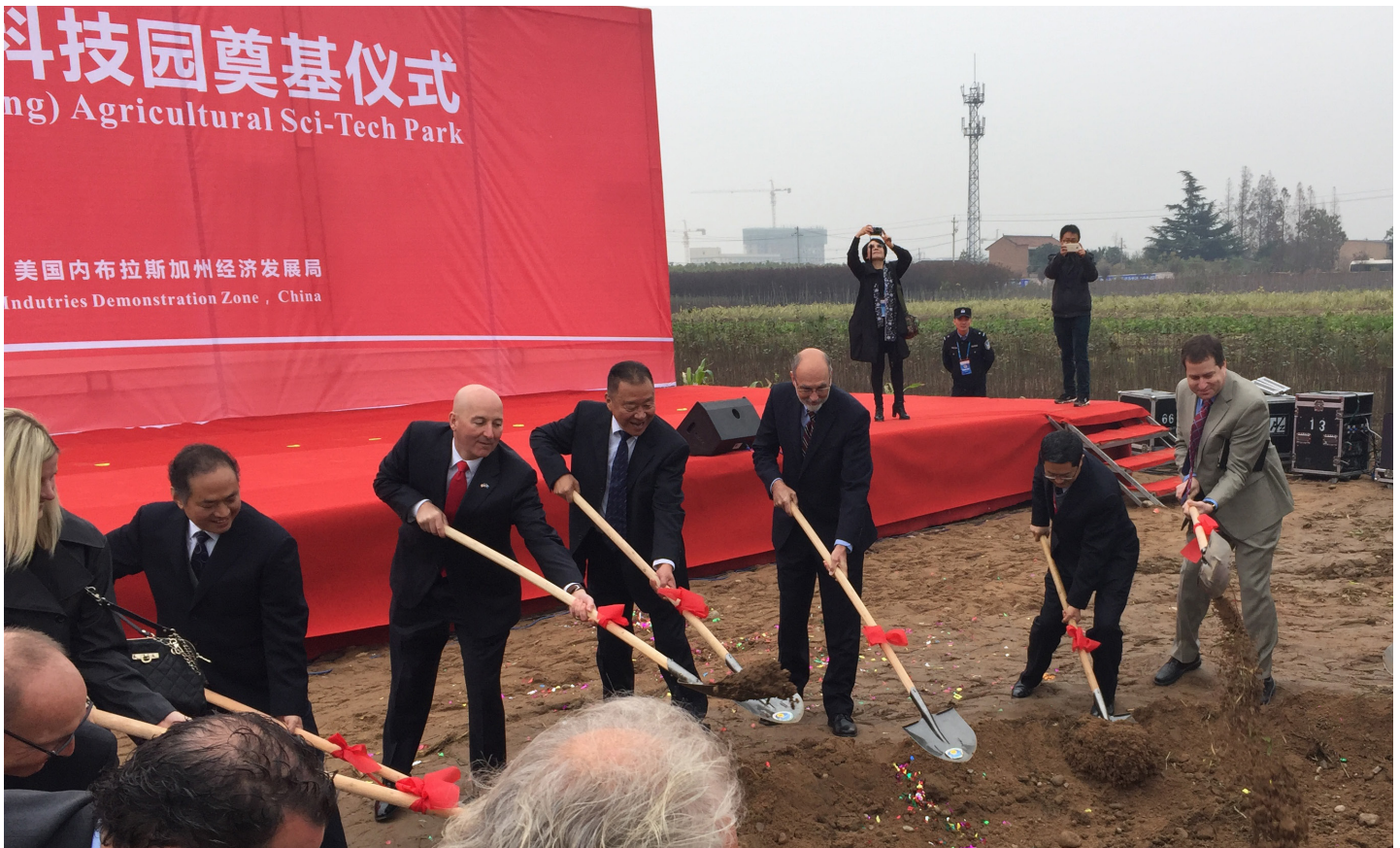
Gov. Ricketts and representatives from Nebraska and Shaanxi break ground on the Nebraska (Yangling) Agricultural Sci-Tech Park in 2016.