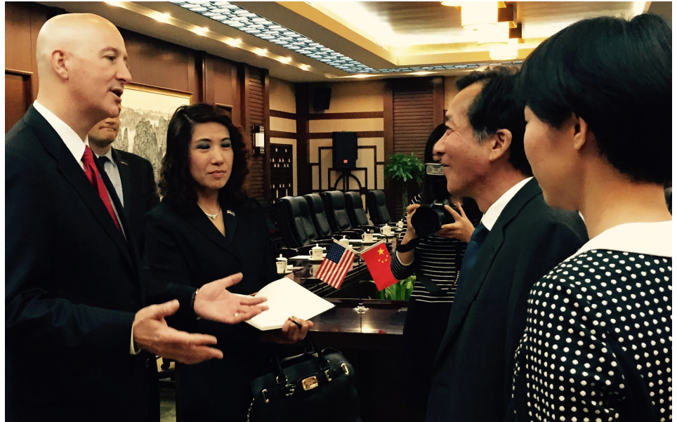
Gov. Ricketts visits China’s Ministry of Agriculture in 2015.

These goals are discussed in greater detail in the pages that follow.