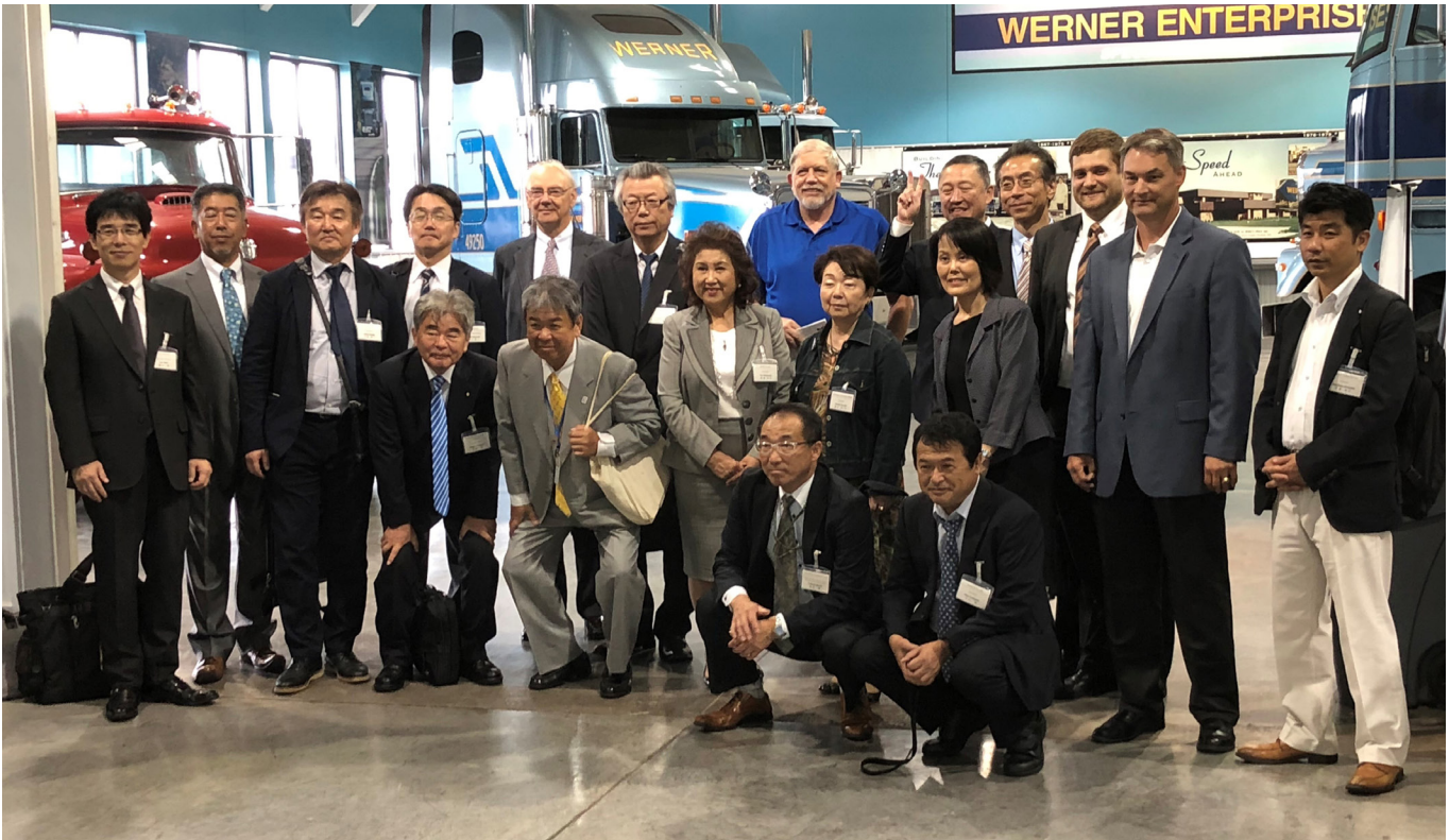
Japanese business delegation tours Werner Enterprises in Omaha in 2018.