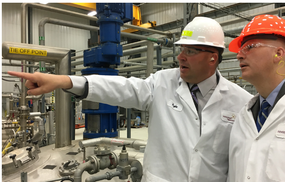
Gov. Ricketts visits Novozymes during the company's expansion celebration in Blair in 2017.

The Council intends to harness its assets and expertise to support and advise NTC, as requested, in its international tourism efforts over the next five years. Consults or partnerships could include, for example, helping NTC prepare for international conferences.