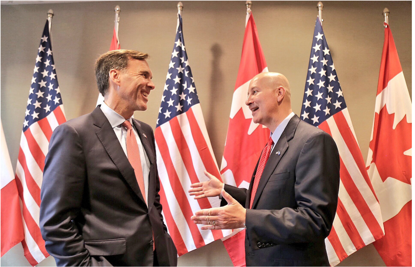
Gov. Pete Ricketts speaking with Canadian Minister of Finance Bill Morneau in 2017.