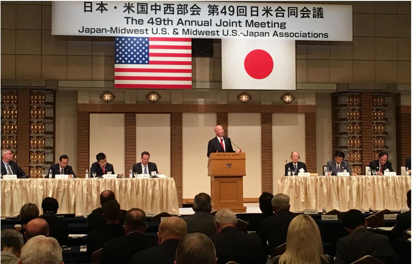
Gov. Ricketts speaks at the 2017 Midwest U.S.-Japan Association Conference in Tokyo.