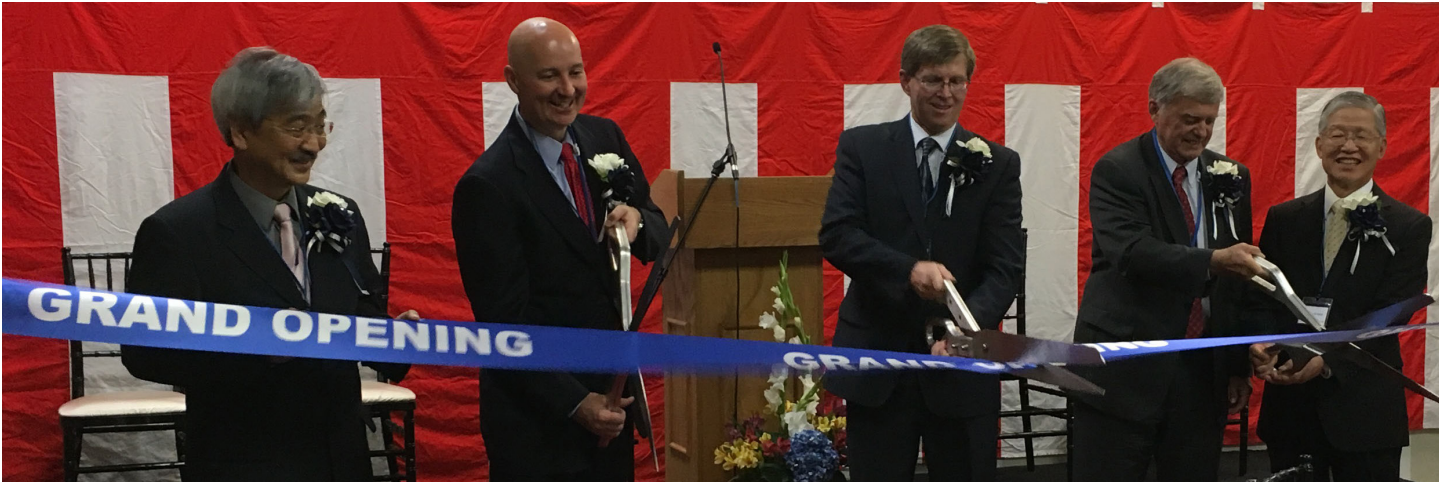
Gov. Ricketts helps cut the ribbon at Morio Denki a Japanese company invested in Lincoln in 2016.