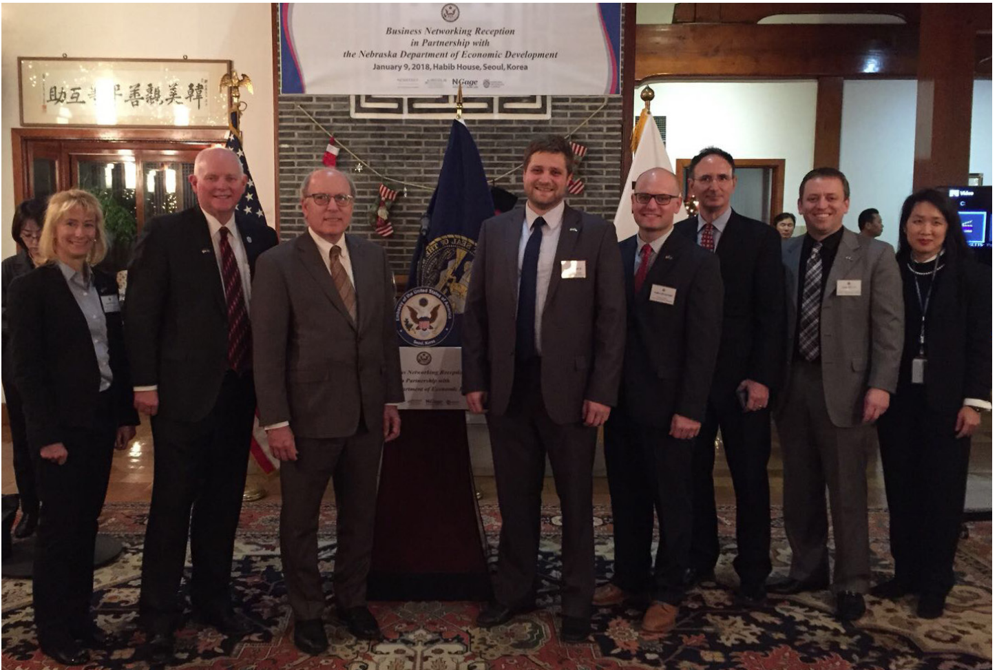
Business Networking Reception in Seoul, South Korea in 2018.