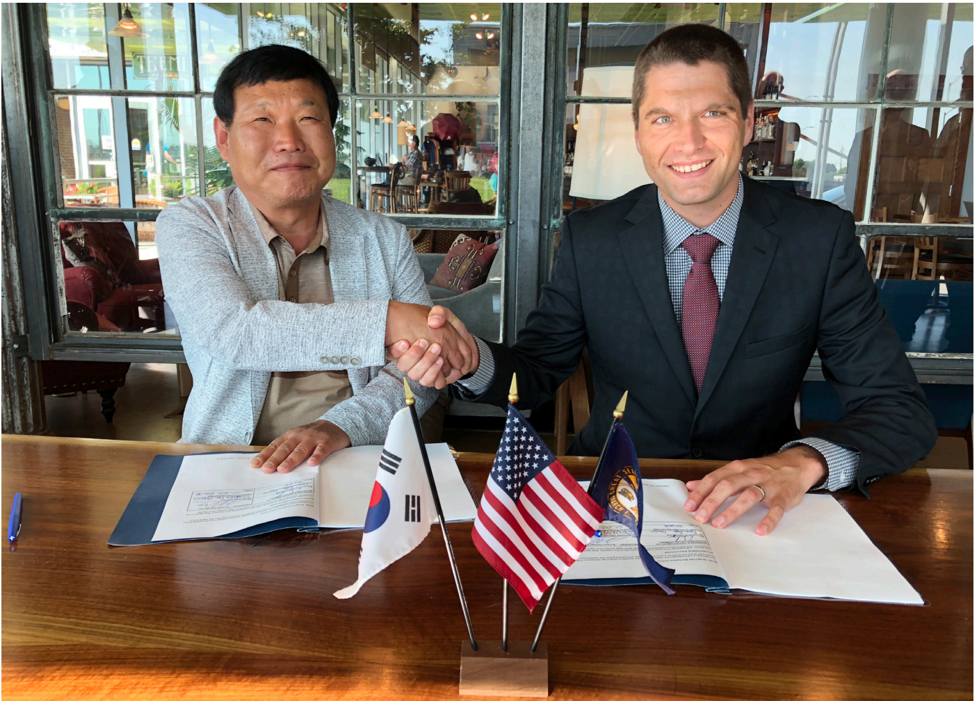
In 2018, Sunseo Omega, Inc., a South Korean Company based out of the Nebraska Innovation Campus in Lincoln, accepts a grant.