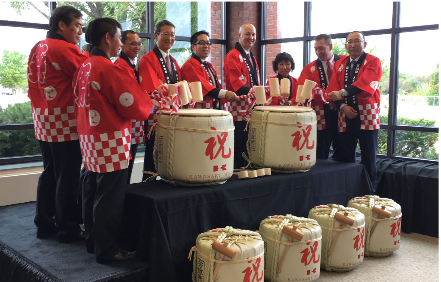
In Lincoln, Kawasaki unveils the company's first aerostructures production line in the U.S. in 2017.