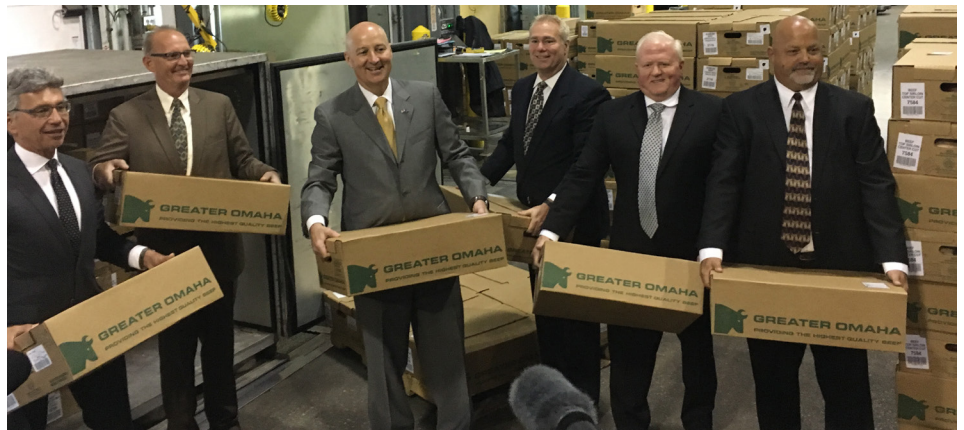
Gov. Ricketts helps Greater Omaha Packing Co. load the first shipment of U.S. beef to China when the country re-opened its markets in 2017.