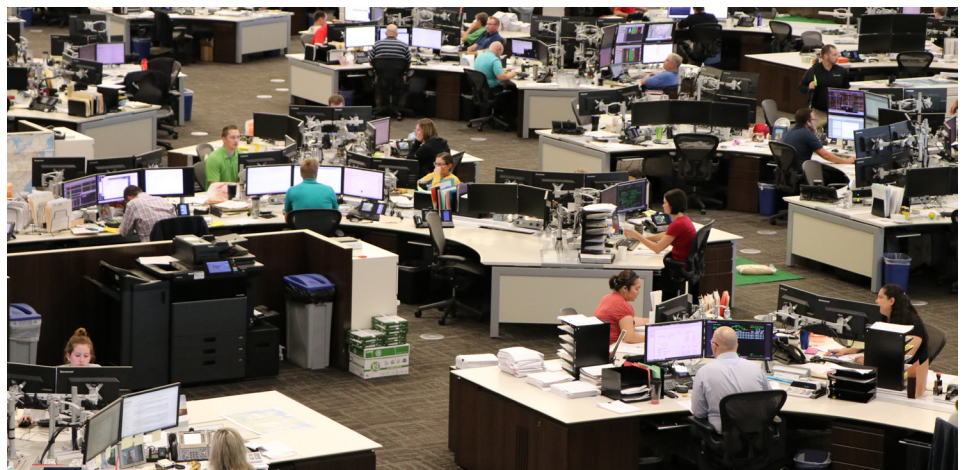
The trading floor at Japanese owned Gavilon in Omaha.