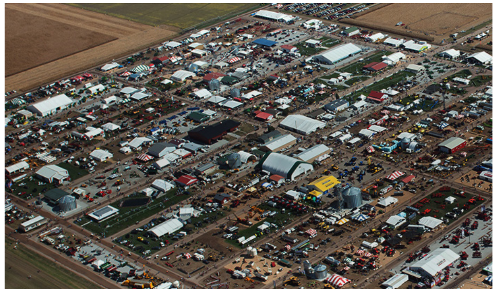
Husker Harvest Days, the world’s largest totally irrigated working farm show.

By providing a clearer outline of the state’s priorities for the near future, council members and other stakeholders will be better able to tie into broader state efforts, thus allowing for more comprehensive and effective impacts.