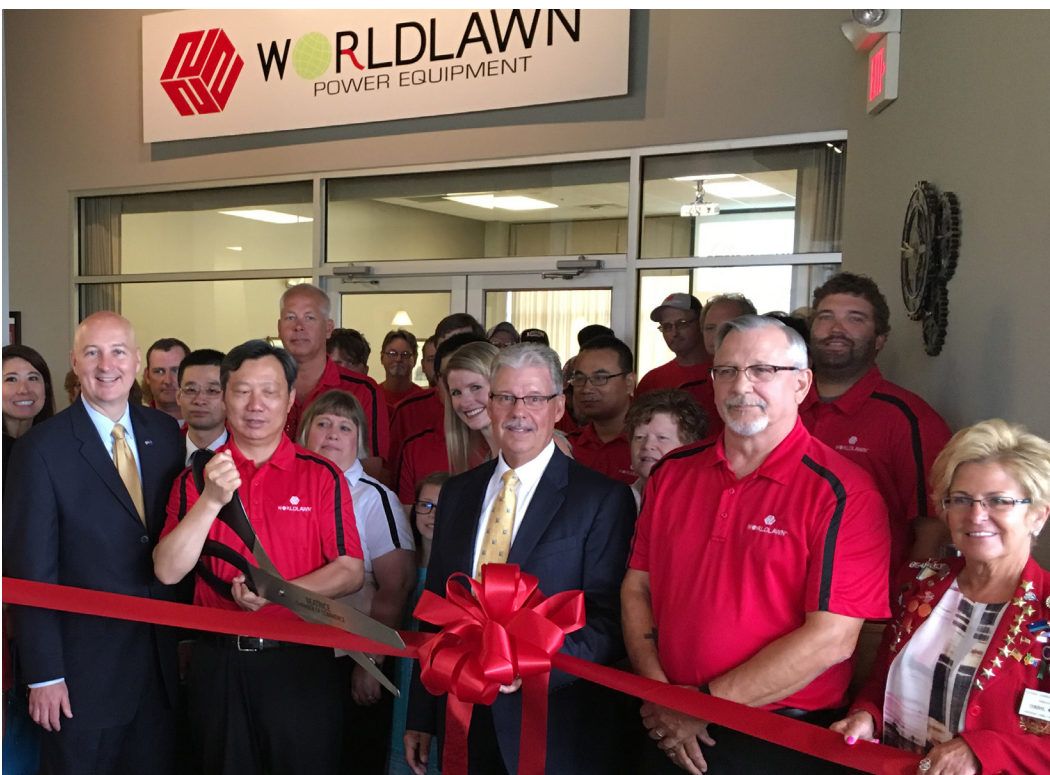
Worldlawn cuts the ribbon to celebrate the opening of a new facility in Beatrice in 2017.