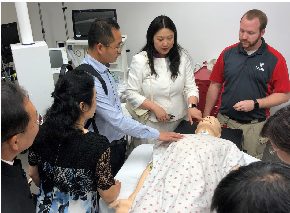
Chinese business delegation tours the University of Nebraska Medical Center in Omaha in 2018.

The Council is currently in the process of formulating a proposed five-year trade mission schedule containing the countries listed in Table 2. (Note that the schedule would allow for item-specific trips as needed). These countries were selected based upon feedback from Council members, and represent probable high-opportunity areas for global business, trade and investment.