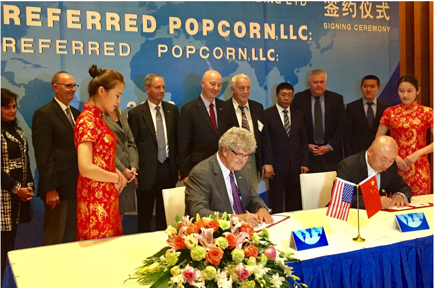
Gov. Ricketts at a signing ceremony between Chinese company Zhong Liang Tian Run Trading, Inc. and Nebraska-based Preferred Popcorn in 2016.